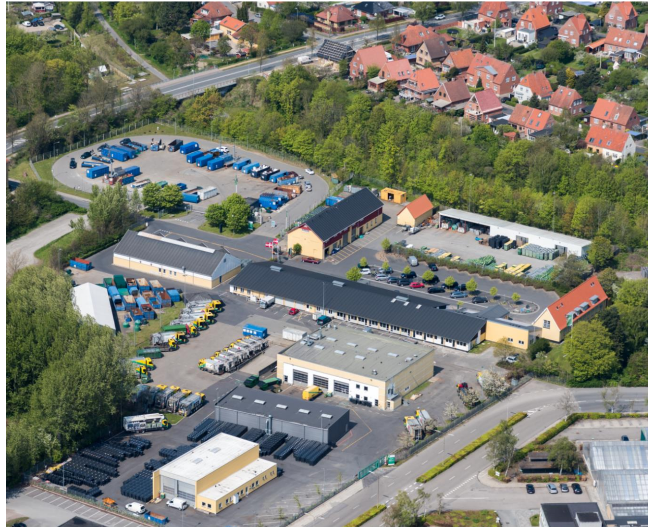
Odense Waste Management headquarter and civic amenity site