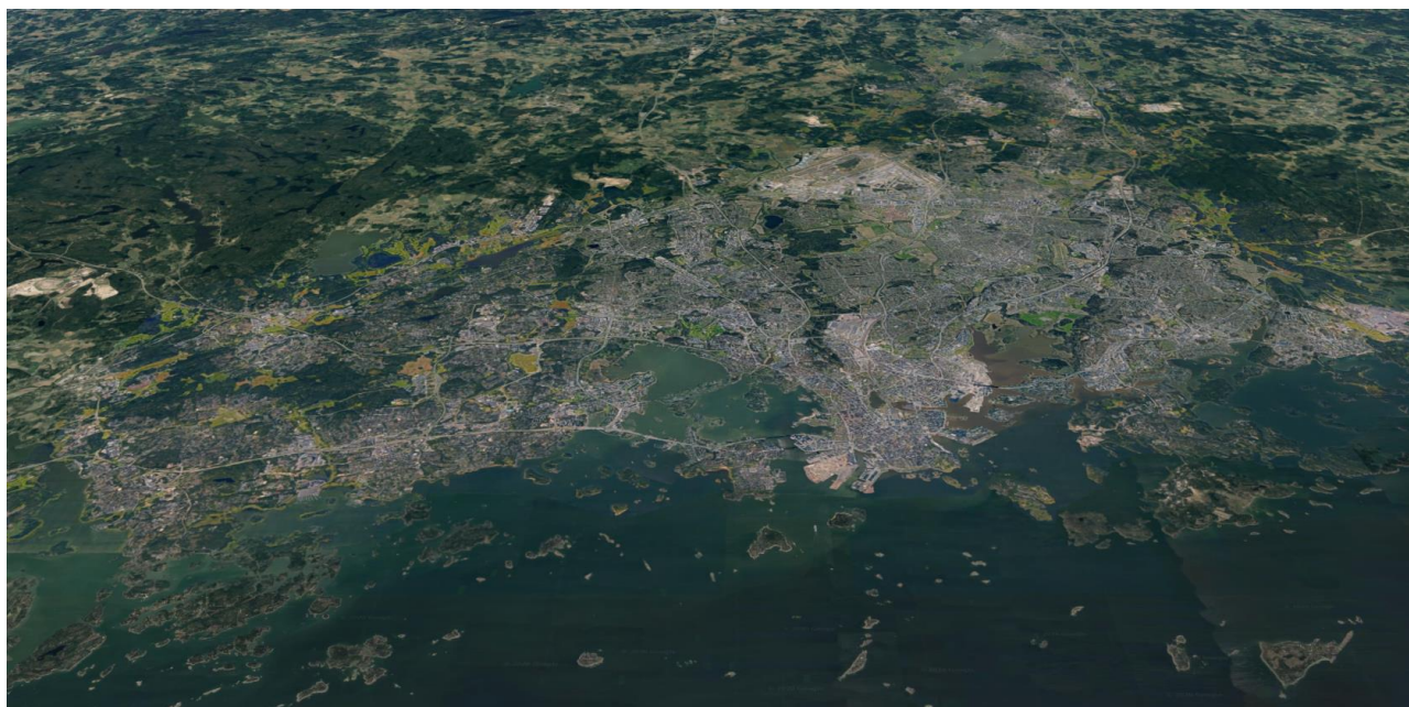
Figure 1. Helsinki Capital Region. Map data: Google, SIO, NOAA, U.S. Navy, NGA, and GEBCO.

This summary presents the main conclusions of one of the regional case studies conducted during the COLLECTORS project. The studies included a life cycle assessment, a cost-benefit assessment, and a circularity assessment. Social aspects were analysed on a general level based on information provided by the municipality and using focus group discussions in different European regions. References to original research reports are provided at the end of this document.